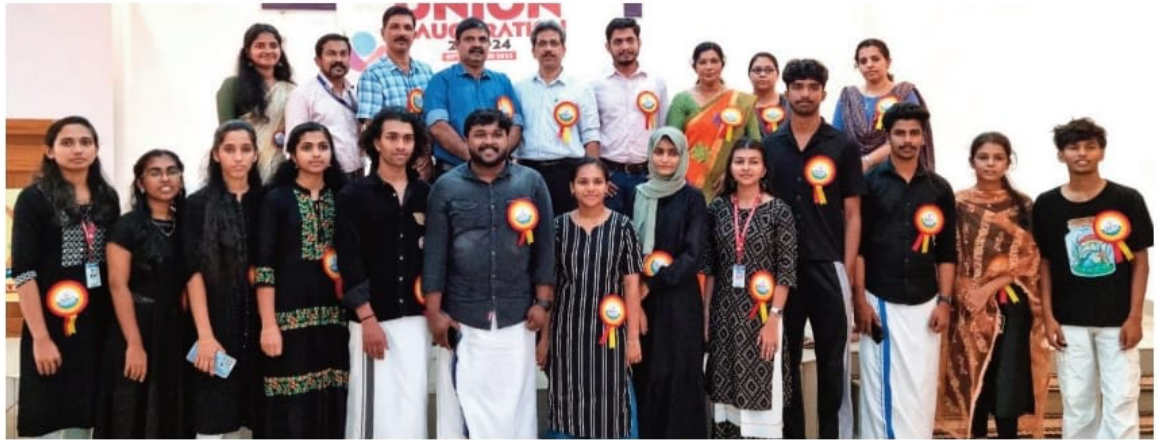
ശ്രീകണ്ഠാപുരം എസ്ഇഎസ് കോളജ് യൂണിയൻ ഉദ്ഘാടനത്തിന് ഭാരവാഹികൾ ഒത്തുചേർന്നപ്പോൾ.